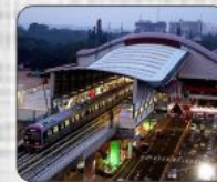
Madhavaram Metro Station