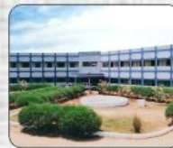
Sri Nallalaghu Nadar College