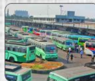
Redhills Bus Stand